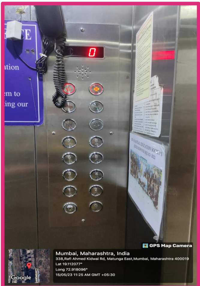
RAMP WITH TACTILE PATH FOR EASY ACCESS